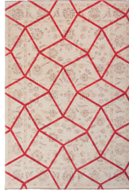
Double layer red