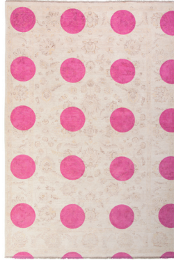
Double layer pink