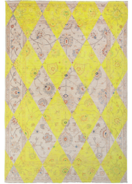
Double layer yellow