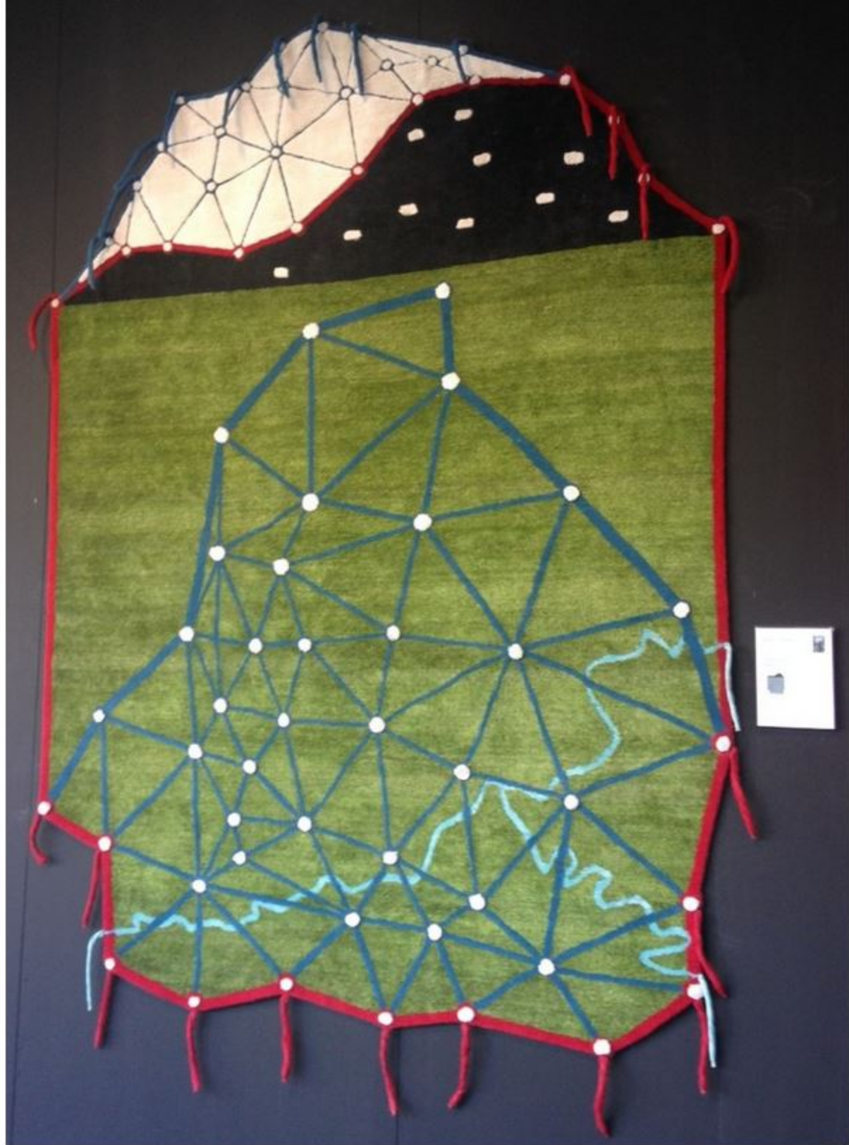
Topographie Imaginaire rug by Matali Crasset for Nodus. An interesting carpet design made of wool, bamboo silk, linen and hemp. The Nodus display for 2015 at the cloisters on Via Cavalieri del Santo Sepolcro featured over 10 striking