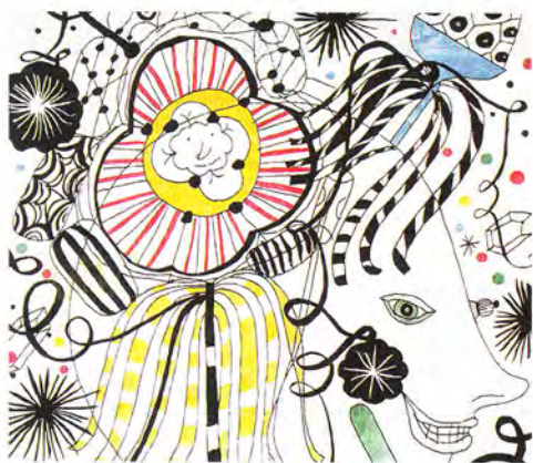
98 Carpets and Rugs 18 options that push bold patterns, op art graphics and vivid hues