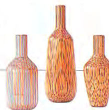
50 Et Cetera Vases made from coloured pencils; foldable wellies; and more