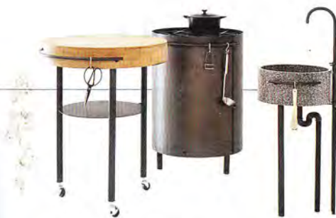
42 Fresh Take Three radical concepts that rethink the kitchen from scratch