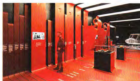
39 Halls of Glory Fabio Novembre's Mondo Milan museum redefines the beautiful game