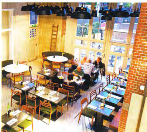
94 Streetcar Sleepover Amsterdam's Hotel de Hallen infuses life into a former tram depot