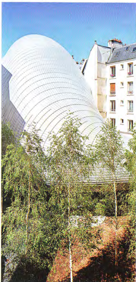
36 Paris is Rising For the Pathé Foundation, a silvery beast by Renzo Piano opens in Paris