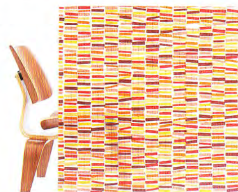
102 Wall Finishes High-performance paints, panels and wall surfaces