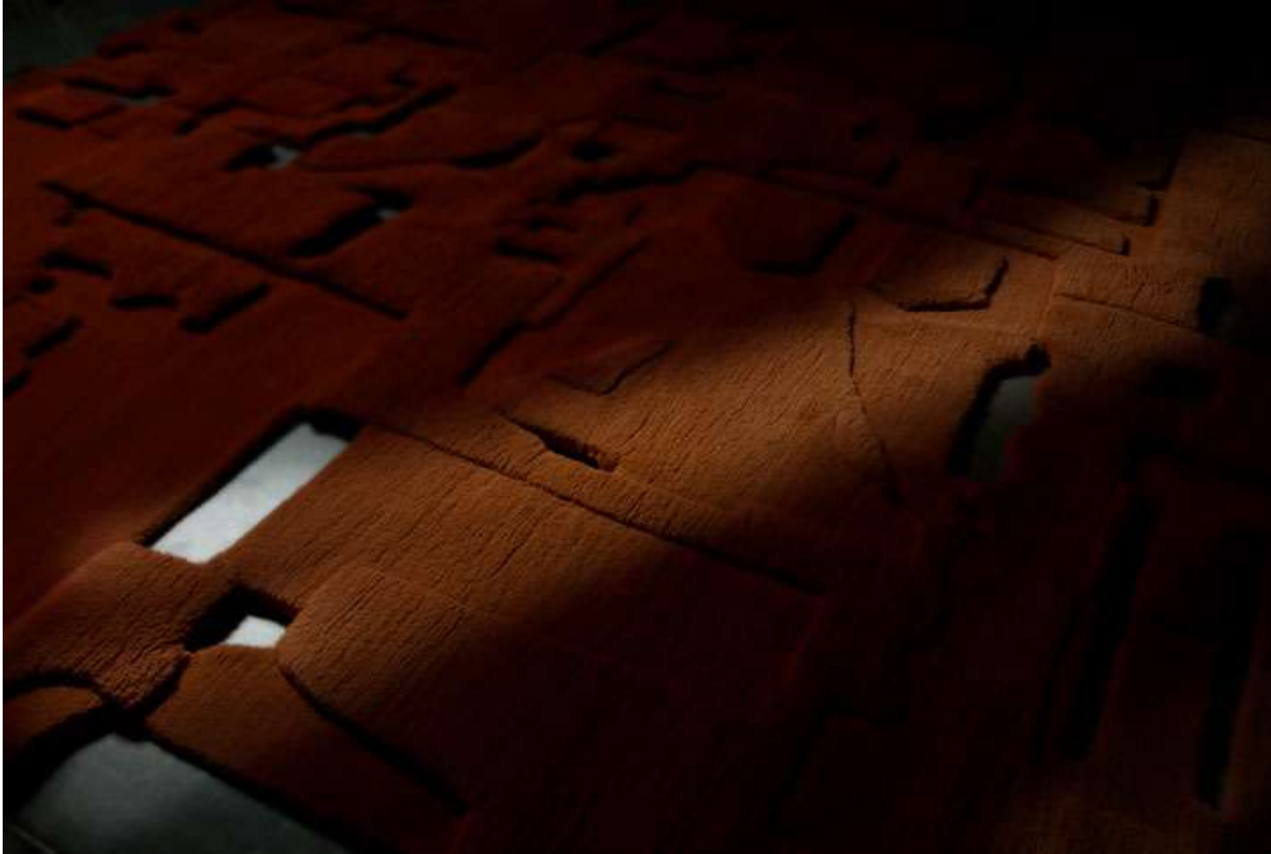
Sao Paulo designed by Fernando & Humberto Campana // detail