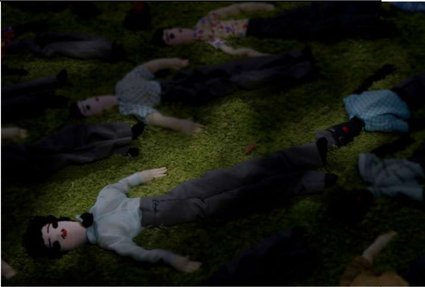
Circus designed by Fernando & Humberto Campana // detail