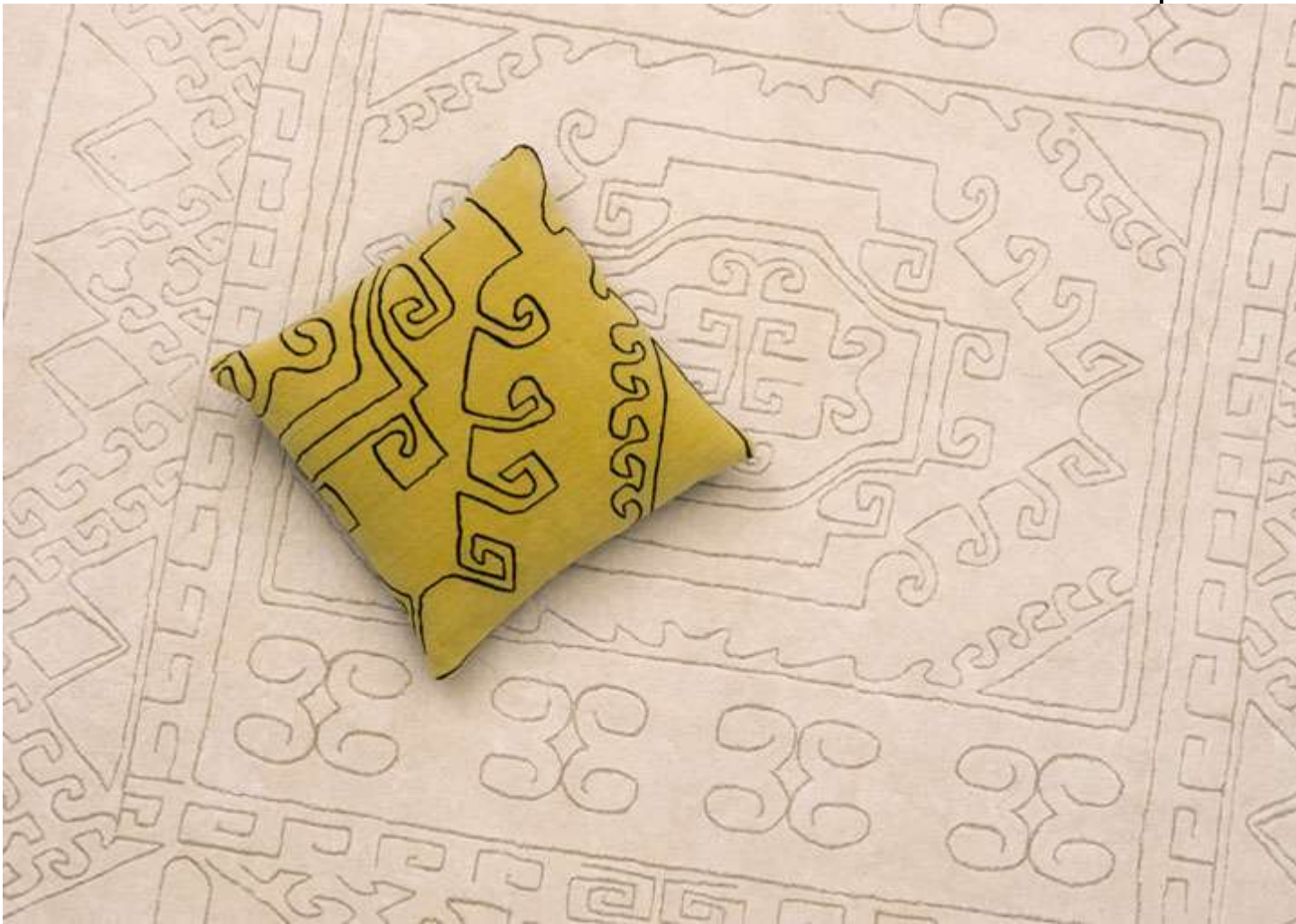
Mr Nest cushion & rug (detail) designed by Paolo Cappello