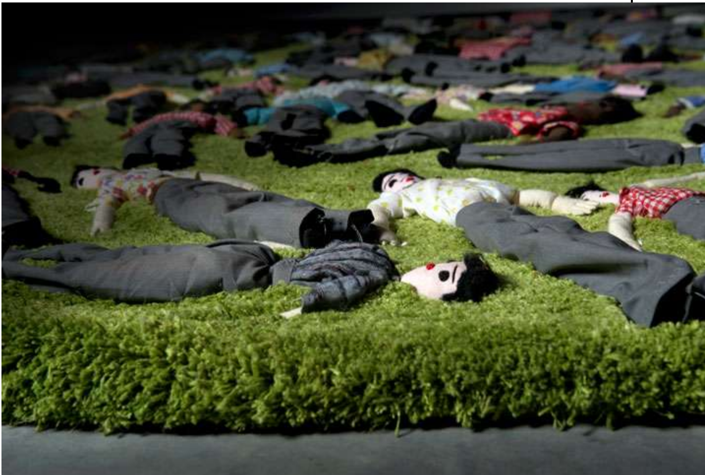
Circus designed by Fernando & Humberto Campana // detail

From the local heart of Milan but amplified vision from designers all over the world, NODUS has a cultural plan. This craft workshop commits to maintaining the tradition and knowledge of carpet design but add value to today's design world by reinterpreting pieces through the eyes of the world's most innovative designers. In this hyper connected world, we can now collaborate and attain aesthetic, philosophical and cultural goals without compromising the end value. Bringing the knowledge and mastery from only the best of places, Nepal, Pakistan, India, Turkmenistan, China and Turkey, NODUS ensures their craft and vision to stay ahead in the world of carpet design.