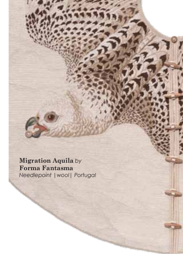
Migration Aquila by Forma Fantasma Needlepoint | wool | Portugal

When the ancient knowledge of carpet design chance upon the vision of the most innovative designers and architects, rest assured a blissful marriage between design and art materialises. NODUS (nodusrug.it) is a creative and cultural lab for experimentation and projects that unites the aforementioned, bringing you exquisite pieces of hand-knotted rugs.