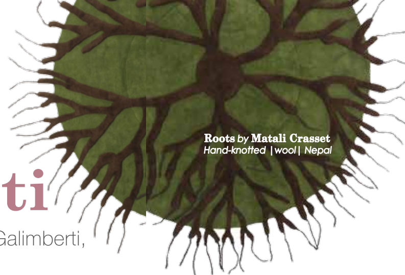
Roots by Matali Crasset Hand-knotted | wool | Nepal