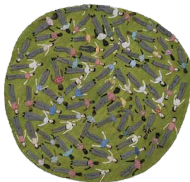
▲ Circus by Estudio Campana Hand-knotted | hemp & rag dolls | Nepal