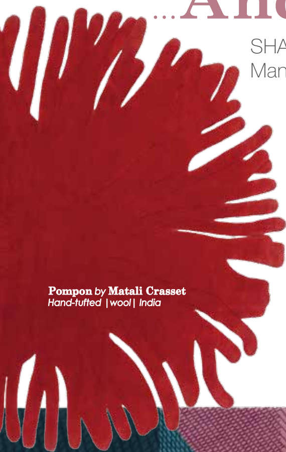
Pompon by Matali Crasset Hand-tufted | wool | India